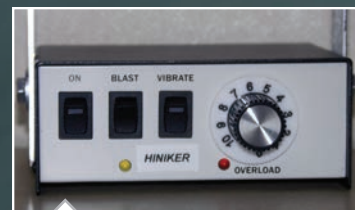
Convenient in-cab variable speed controller with blast control and control for optional vibrator.