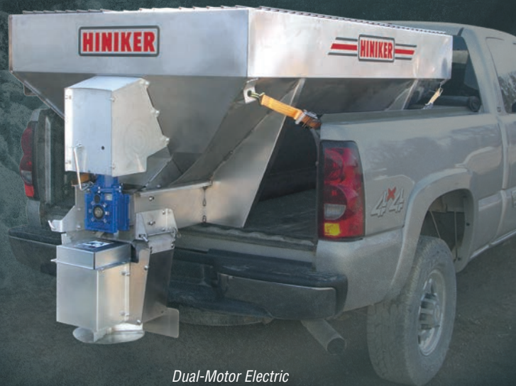
Dual-Motor Electric AUGER DELIVERY SPREADER