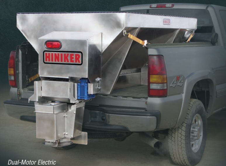
Dual-Motor Electric CONVEYOR DELIVERY SPREADER

PROFESSIONAL PERFORMANCE PROFESSIONAL STRENGTH PROFESSIONAL RESULTS