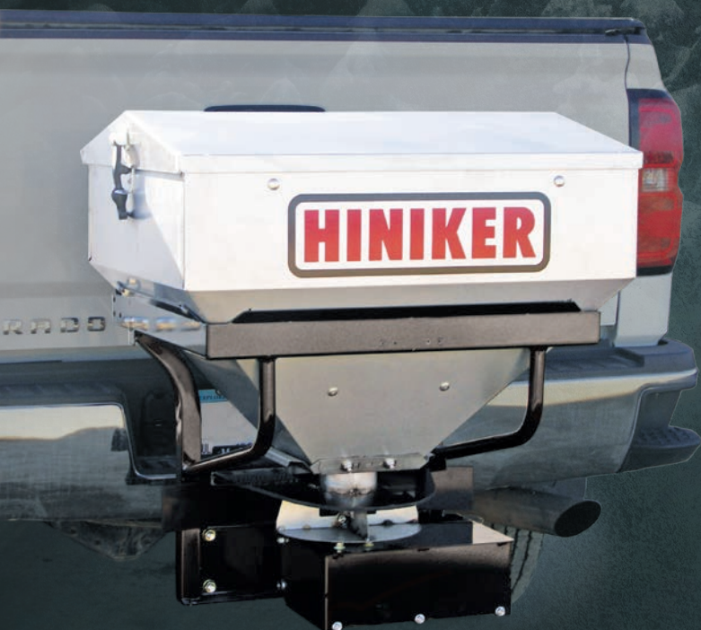
Stainless Steel TAILGATE SPREADER