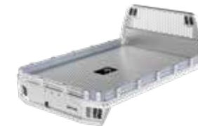
ALUMINUM 6" HIGH SIDES