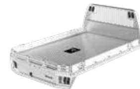
ALUMINUM DROP SIDES