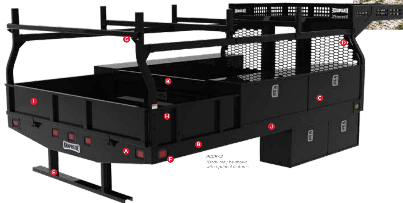
PCCR-12 *Body may be shown with optional features

Visit knapheide.com/quote and fill out the form to receive a quote and additional product information.